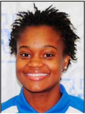
3 India Cross Fr. F 5'6" Upper Darby, PA / Upper Darby H.S.